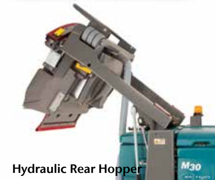
Hydraulic Rear Hopper