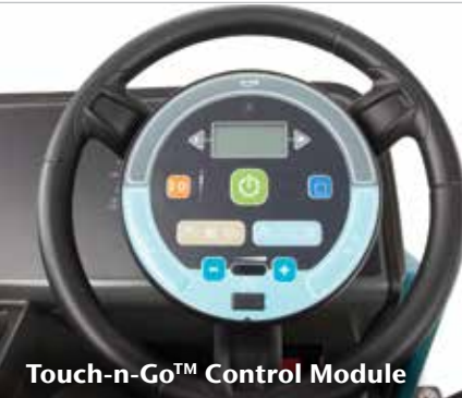
Touch-n-Go™ Control Module

▶ Touch-n-Go™ control module with 1-Step™ start button allows operators quick access to all settings without removing hands from the steering wheel.