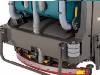
Dura-Track™ Parabolic Squeegee

Overhead guard protects operators from falling objects.