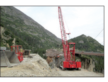
ADOTP&F Tackles Challenges to Replace Capt. Moore Bridge...8