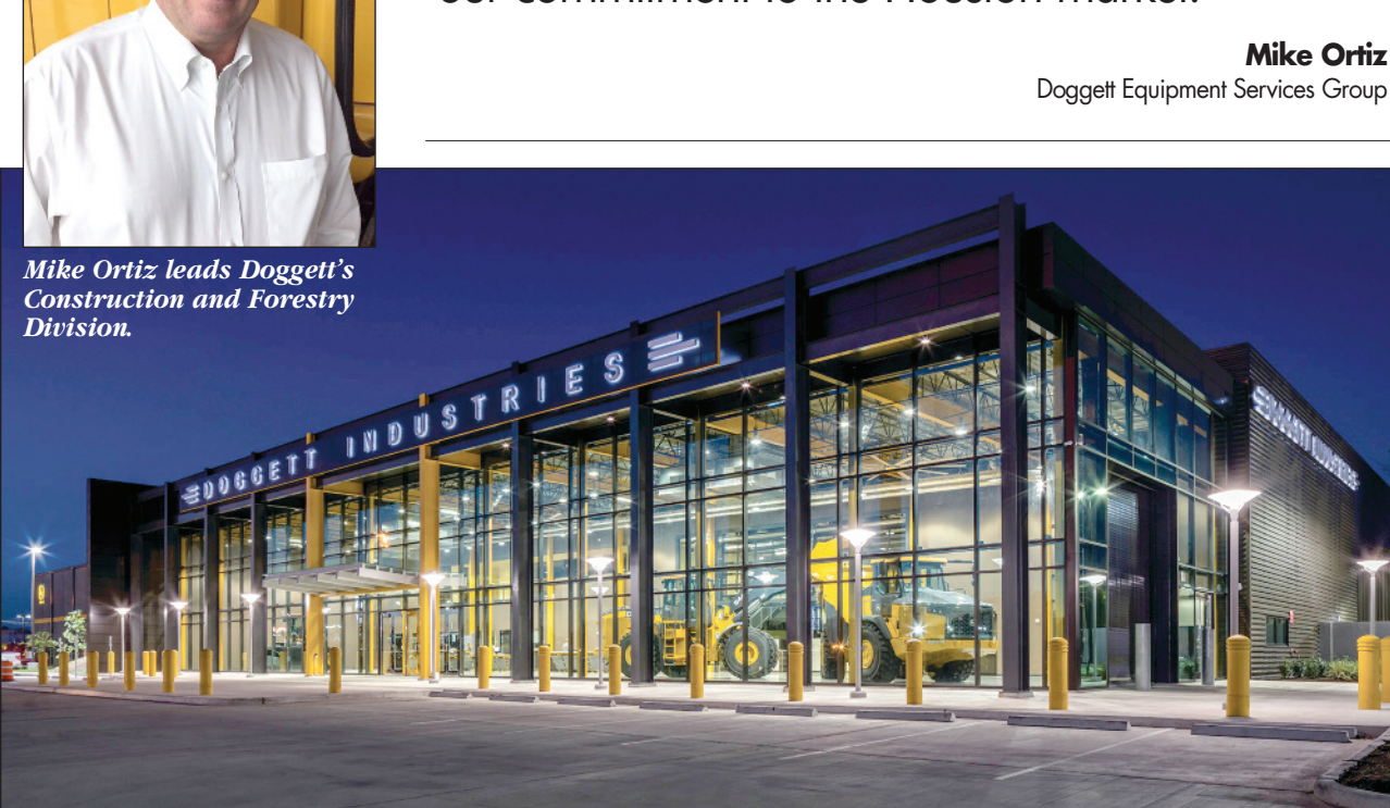
Doggett Industries' aim is to be a one-stop supplier to the construction and industrial markets.

"We wanted to build a premier service facility. We truly wanted the building to be a statement as to our commitment to the Houston market."