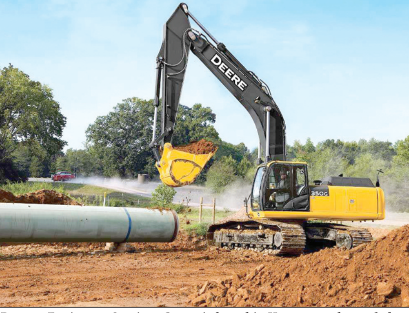
Doggett Equipment Services Group is based in Houston and greatly benefits from pipeline construction in both the Permian Basin and Eagle Ford Shale of south Texas.