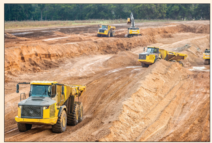
The hot Texas economy is only one factor in the rapid growth of the company.